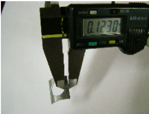
How to measure trimmed shim.

When stacking, compress each shim separately before final tightening.